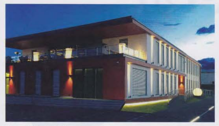
Figure 4: Champion HQ