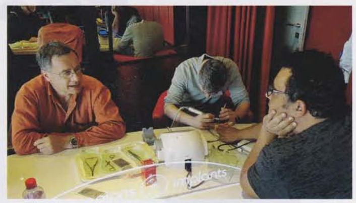
Figure 5: Delegates learning during the course