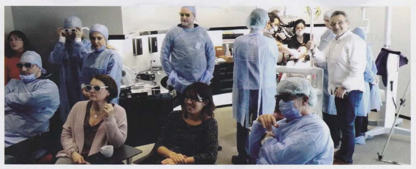
Figure 6: Learning on site

With the ø 2.4mm — Condenser, the condensation is performed for the whole implant working length +2mm. While leaving the Condenser, you start with the preparation. By means of the Angle Modulator, the three layers (vestibular lamella, periosteum, and attached gingiva) are mobilized vestibularly.